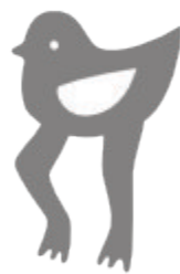
Medium Solid Engrave RGB(128, 128, 128)