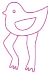
Medium line RGB(255, 0, 255)