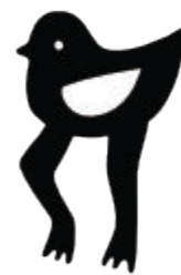
Dark Solid Engrave RGB(0, 0, 0)

Every material has different properties and therefore some may not have distinguishable types of engraving. These effects work best on wood.