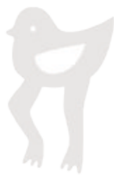
Light Solid Engrave RGB(230, 230, 230)