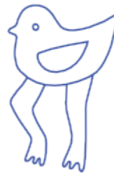
Dark line RGB(0, 0, 255)