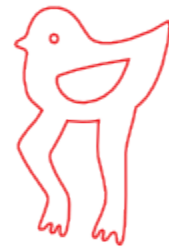
Cut Through RGB(255, 0, 0)