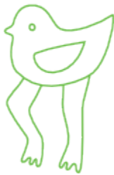
Light line RGB(0, 255, 0)

Laser cutters are capable of not just cutting straight through a material but also engraving the surface. When designing your files please colour each part how you would like it to be cut/engraved.